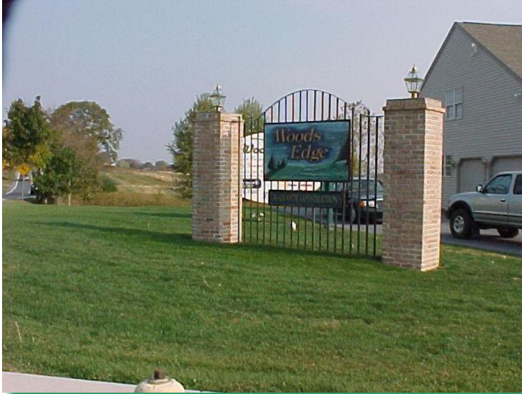
Entrance to Woods Edge