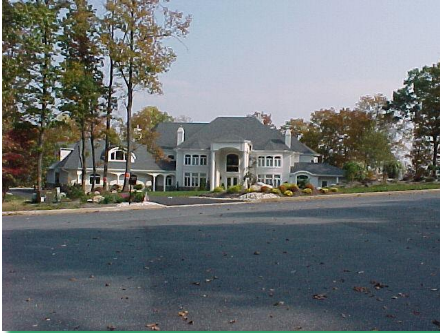
Residence at The Vineyards